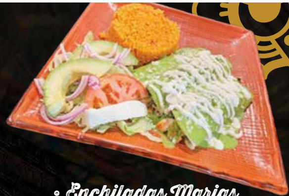
• Enchiladas Marias

Three shrimp or chicken enchiladas covered with chipotle sauce, sour cream and queso fresco. Served with rice and salad – 14.00